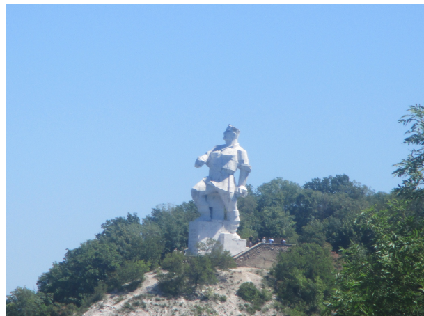
Statue of Artum overlooking the valley