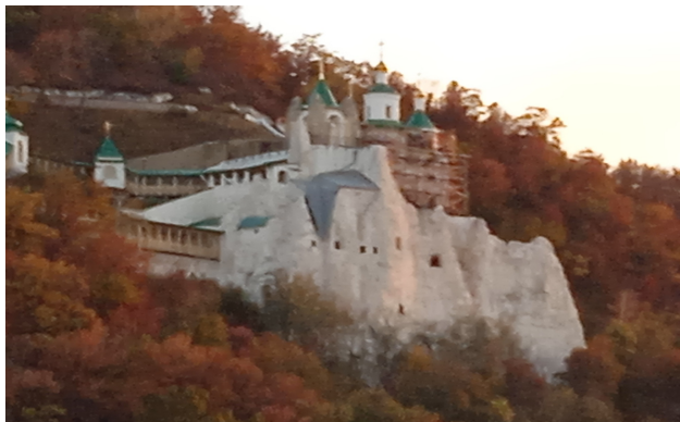
Original part of monastery

Sunday I preached and taught Bible class in Kramatorsk. We spent most weekdays teaching either adults or children at three congregations, depending on the day and class schedule. Each of us averaged about three lessons a day. We taught a wide range of topics and let